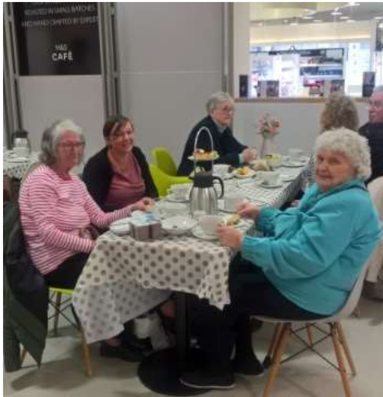
Marks & Spencer tea party