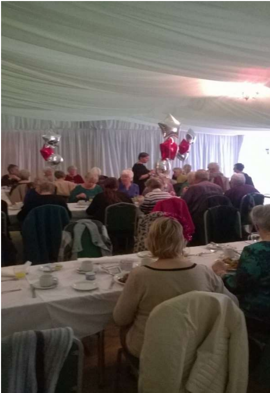
Priory Campus Christmas party