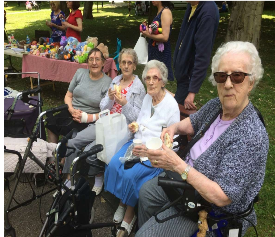
Tea in the Park