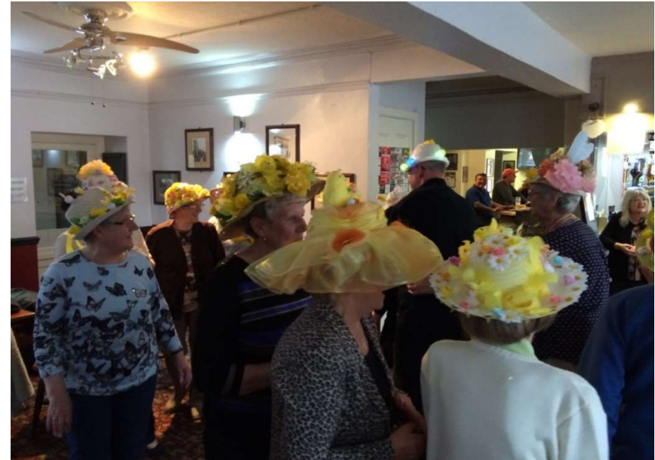
Oakwell Easter bonnet parade